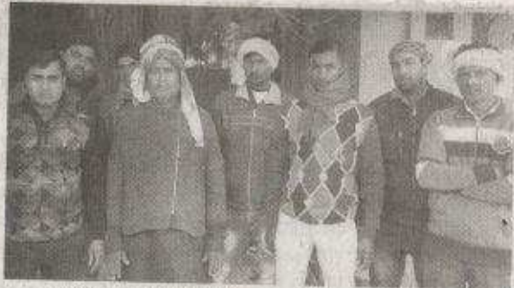
मोचरी हाउस पर घटना की जानकारी देते मृतक के परिजन।